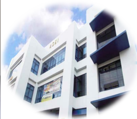
ASKI Headquarters Cabanatuan City, Nueva Ecija Philippines