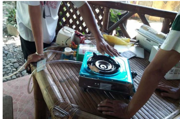
100 hog raisers have functioning biogas digesters for manure disposal and production of biogas which they used for cooking instead of commercial gas.