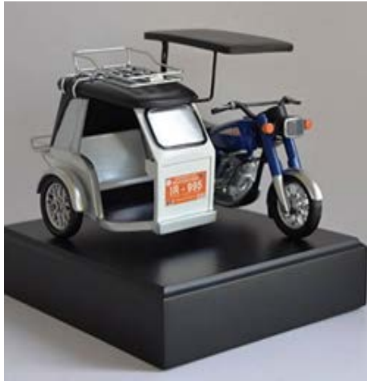
Cabanatuan City is the Tricycle Capital of the Philippines