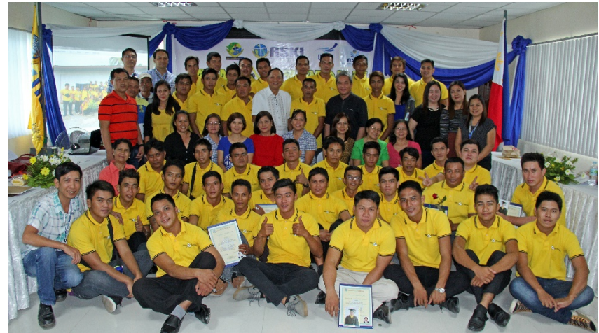
From jobless urban men in Cabanatuan City, ASKI and WTRC program produced 60 TESDA graduates during the first batch. Among the graduates, 73% are now employed and two of them are working overseas.